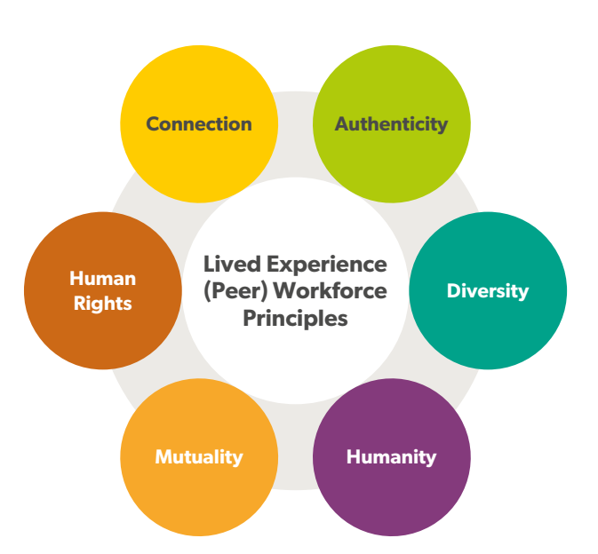
Figure 4: Guiding Principles for Lived Experience (Peer) work

These principles were generated in a co-design process during the development of this Framework, for and by people with lived experience and peer workers. Members of the Peer Practice Expert Group reflected on peer work and lived experience principles (and what they looked like in practice) from nine interstate and international sources. They identified six principles that held true for Lived Experience (Peer) workers in the mental health, suicide prevention and alcohol and other drug sectors. The final principles are intentional, purposeful and deliberate. These principles were also mapped against the guiding principles and core values of Lived Experience work outlined in the National Mental Health Lived Experience (Peer) Workforce Development Guidelines to ensure alignment and consistency.