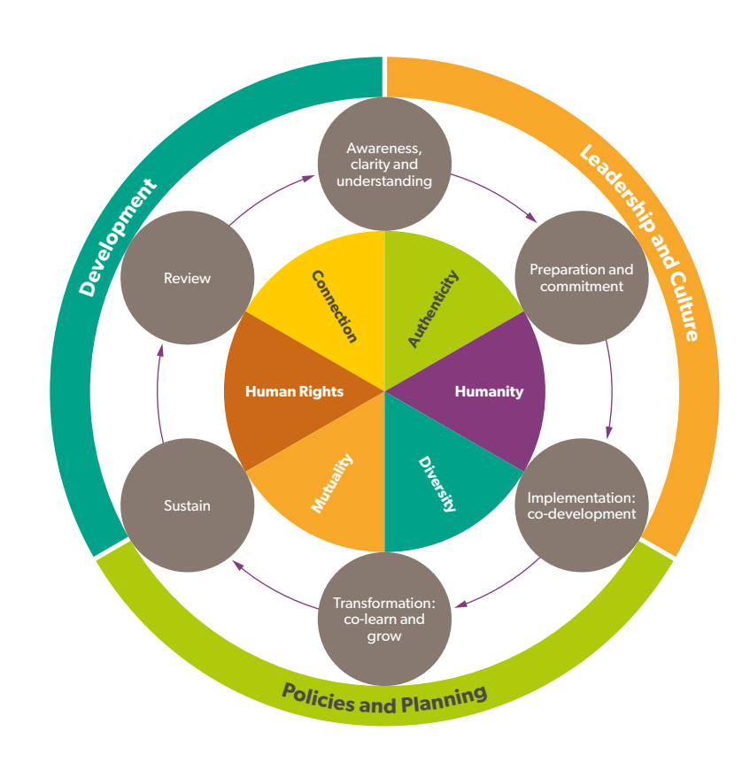
Figure 13: Principles and components of Lived Experience (Peer) work and levers for organisational development.

Figure 13 on the right was synthesised from feedback received through the WA Lived Experience (Peer) Workforce Project consultations. It reflects the embedding of Lived Experience (Peer) principles in the centre of the system with key components and levers for organisational development.