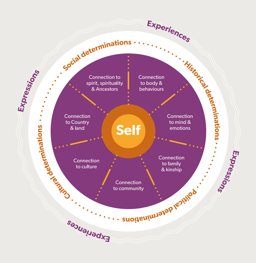
Figure 8: SEWB from an Aboriginal and Torres Strait Islanders' Perspective.

It is important that individuals are offered a choice, not just linked in with a First Nations Peoples Lived Experience (Peer) worker because they are also a First Nations person. There may be cultural obligations and traditional ways that prevent them from working with particular people.