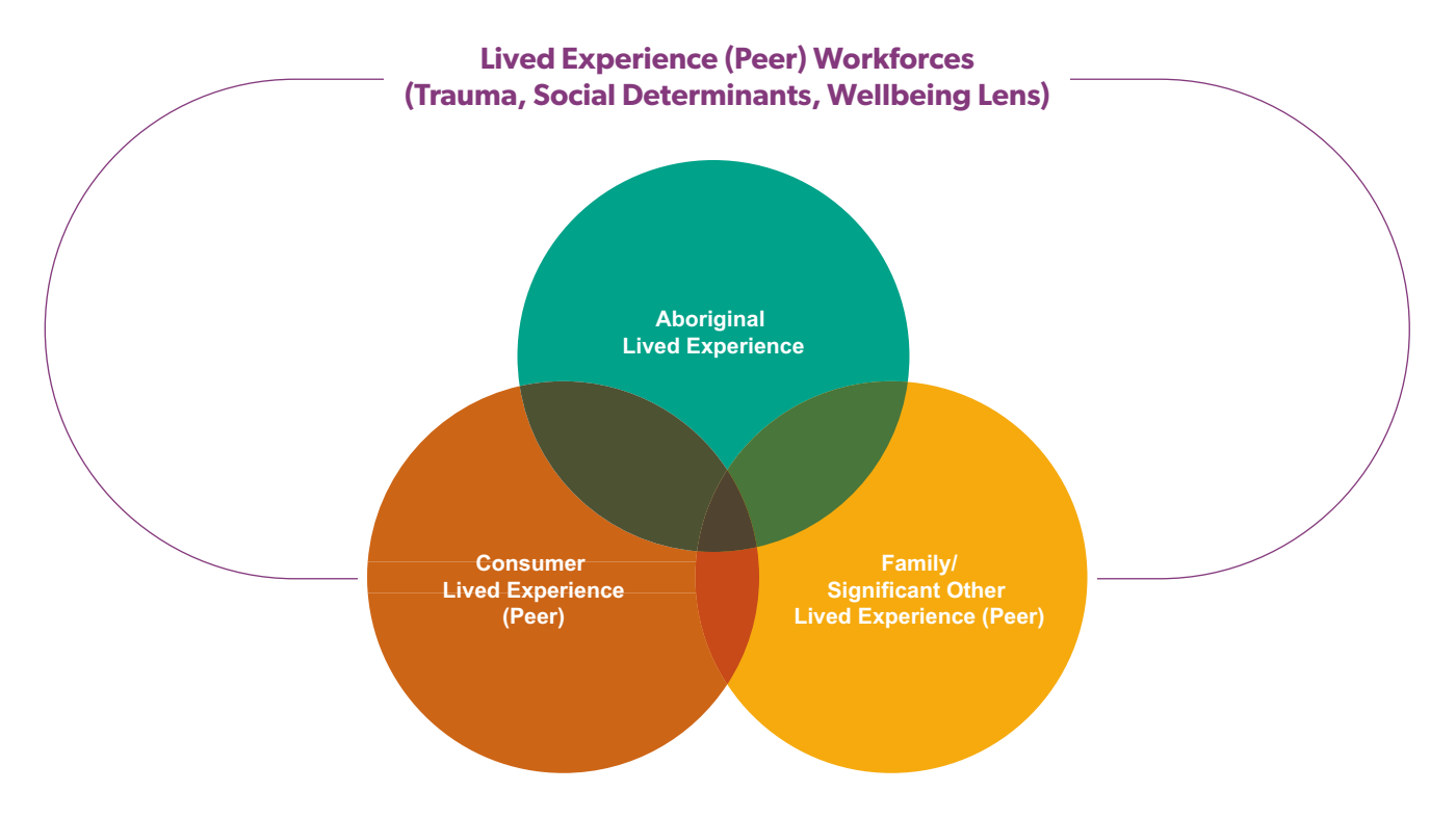
Figure 5: Lived Experience (Peer) Workforces and Specialisations