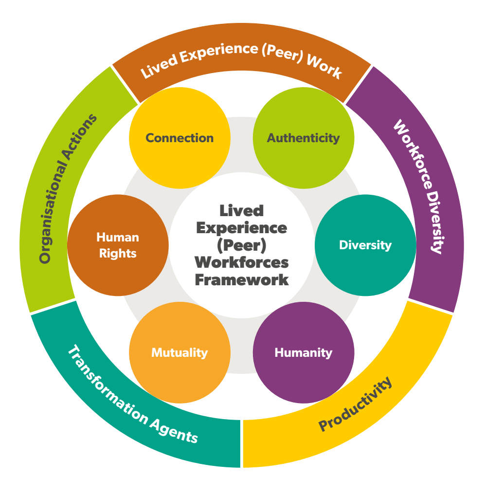
Figure 3: WA Lived Experience (Peer) Workforces Framework.