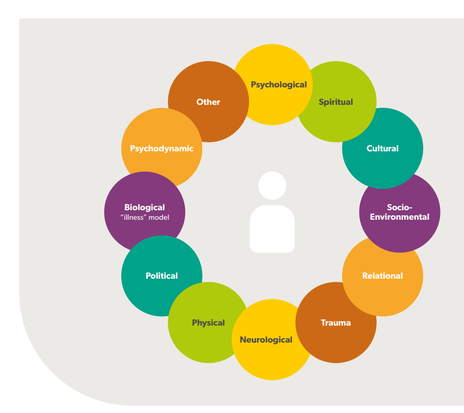
Figure 1: Example of different explanatory frameworks for understanding mental distress.

of explanatory frameworks, services are better positioned to respond to people in their context, in ways that focus on promoting and resourcing a quality life<sup>ix</sup>. This can happen whether a person is experiencing stressors due to social and health inequalities. Lived Experience (Peer) workers can help individuals to understand these different worldviews and help them decide which works best for them.