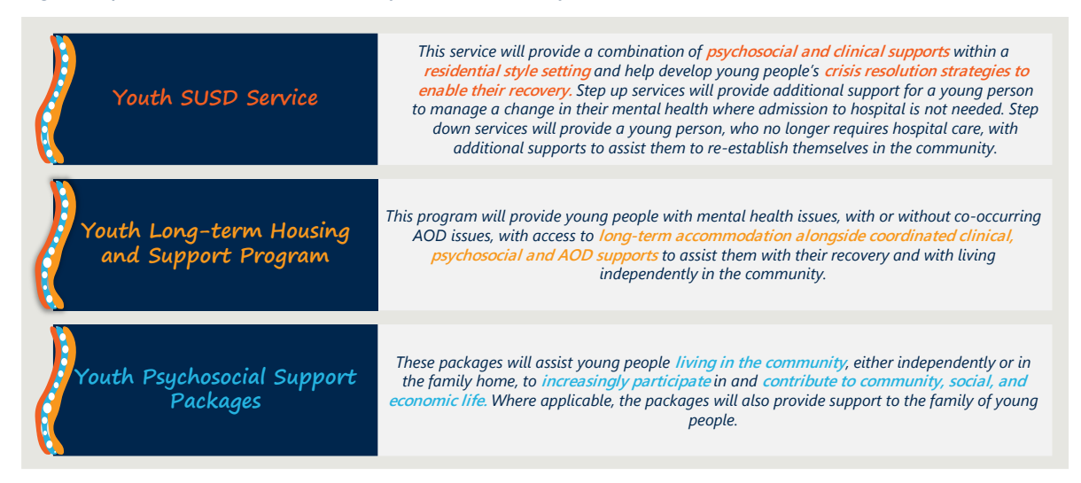
Figure 2 | An overview of three new youth community support and accommodation services

The MHC engaged Nous and YACWA to undertake targeted consultations in the Perth Metropolitan area to inform the Model of Service (MoS) for each of the new youth community support and accommodation services. The process was designed with a commitment to the methodology of co-design that ensures feedback and input by young people, including those with lived experience, was sought and considered for all aspects of the design process (facilitated by YACWA). This was alongside a series of sector-wide consultations with service providers, government agencies, peak bodies and people, carers, and family members with lived experience (facilitated by Nous).