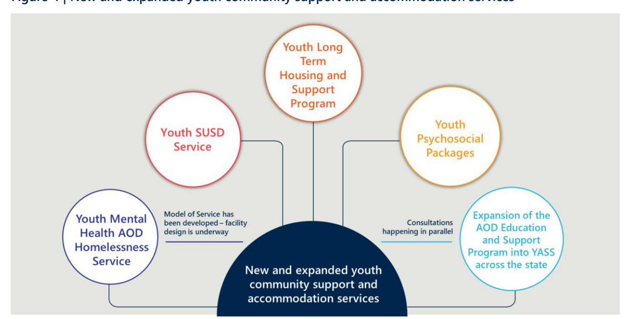
Figure 4 | New and expanded youth community support and accommodation services

The funding of these three services reflects significant investment by the State Government in developing a specialised youth mental health and AOD service system in WA. In early 2021, A MoS was developed for a new Youth Mental Health AOD Homelessness Service in the Perth Metropolitan area, which has been followed by four election commitments for new and expanded community support and accommodation services (those included in this report, and one other: expansion of the AOD Education and Support Program into all Youth Accommodation Support Services (YASS)) – outlined in Figure 4 | New and expanded youth community support and accommodation services.