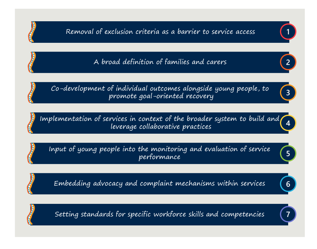
Figure 3 | Common features

Insights from the consultation process with young people has resulted in a set of common features that stakeholders would like to see applied to the design, delivery, and implementation of all three new youth community support and accommodation services.<sup>13</sup> These features (outlined in Figure 3) are applicable across all three services and all are in an addition to the expectation that the voices of young people and lived experience continue to have a significant role in the design, delivery, and system-level planning for youth mental health and AOD services.