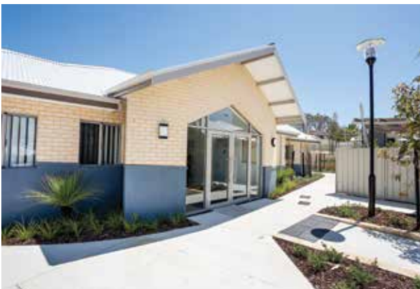
Joondalup Community Mental Health Subacute Service

Feedback received during the consultation process for the Plan indicated King Edward Memorial Hospital does not need mental health observation area (MHOA) beds. These beds are therefore no longer planned.